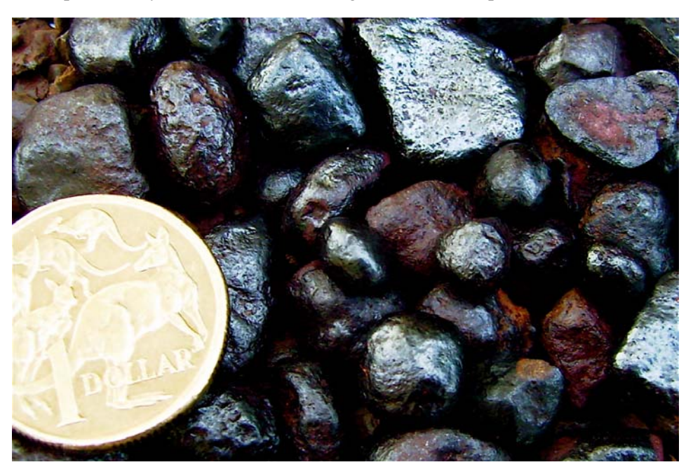
Figure 1 - Maghemite (Fe<sub>2</sub>O<sub>3</sub>) iron rich pisolites from PlatSearch's Eastern Iron Project

Two phases of preliminary shallow aircore drilling have been completed at six sites and the results are