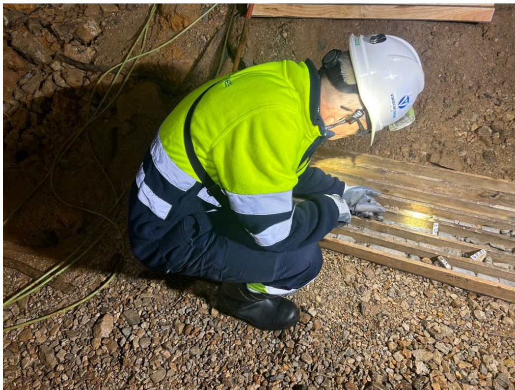
Figure 1. Drill core inspection during Phase 3 underground drilling at the San Jose Mine.