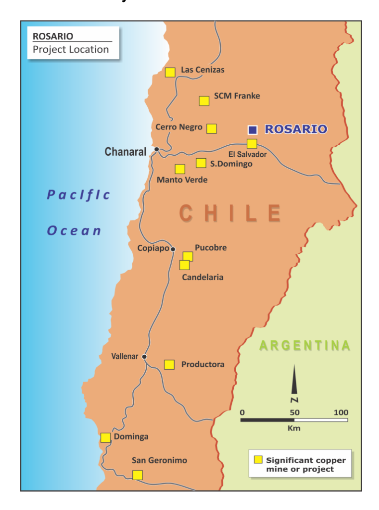
Figure 1. Location of the Rosario Project

The Rosario project comprises two large granted exploration concessions, Rosario 6 and Rosario 7, and further adjacent exploration concessions under application. Rosario 6 and Rosario 7 cover two partially outcropping copper trends (Zones A and B) over a combined strike length of approximately 6 kilometres (Figure 3).