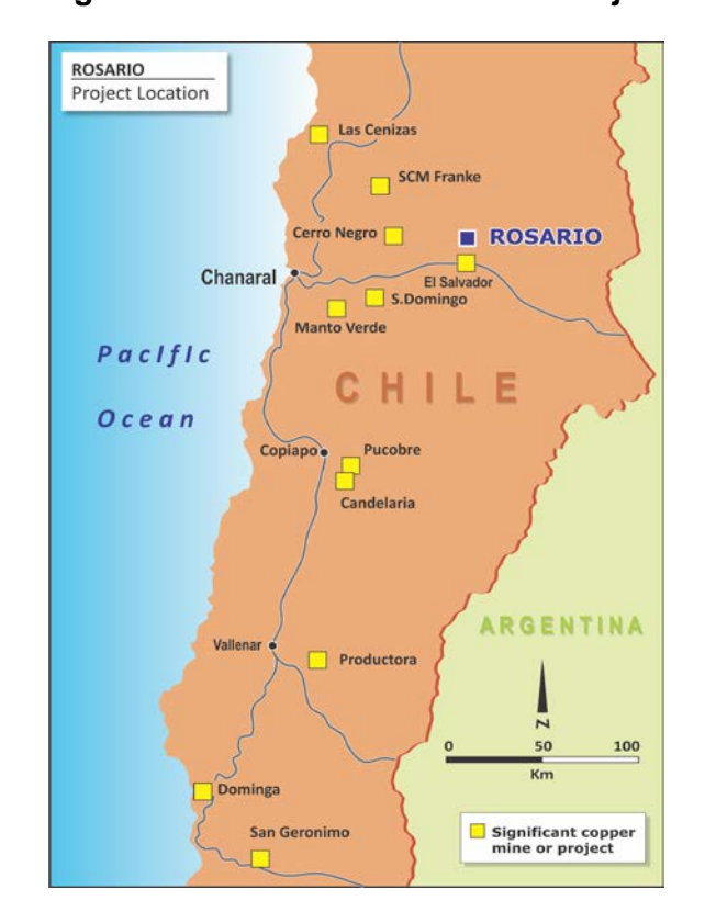
Figure 2. Location of the Rosario Project

The Rosario project lies about 20 kilometres north of the El Salvador mine (owned by Codelco). It is one of the country's larger copper operations, within a region of dense mining activity (all scales) and good copper endowment.