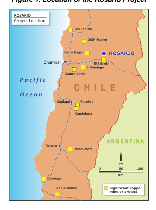
Figure 1. Location of the Rosario Project

The Rosario project comprises two large granted exploration concessions, Rosario 6 and Rosario 7, one exploitation concession (Salvadora) and an exploration concession (Rosario 101) under application. These cover two partially outcropping copper trends (Zones A and B) (Figure 3) over a combined strike length of approximately 6 kilometres.